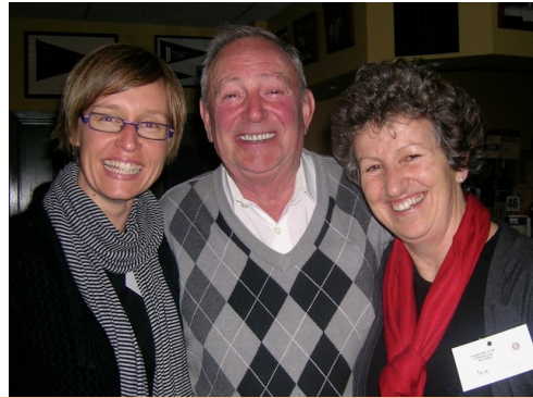
A thorn between two roses