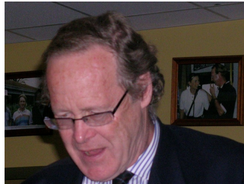
FROM 30TH AUGUST

Running course and back before Christmas.